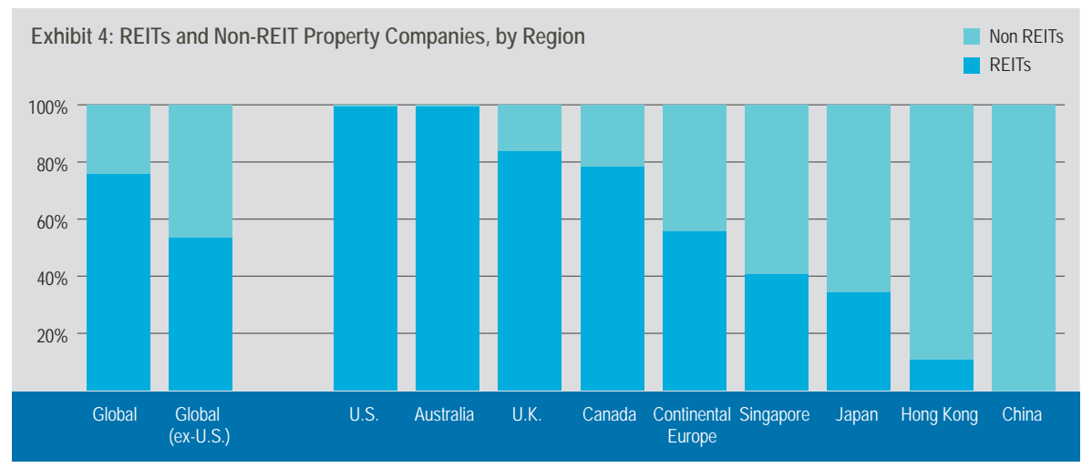
As of June 30, 2012.

Based on the FTSE EPRA/NAREIT Global Real Estate Index. REIT and non-REIT classifications provided by FactSet. Investors cannot invest directly in an index. See page 14 for index definitions.