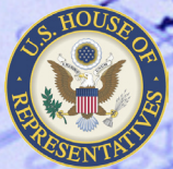
Congressman Devin Nunes